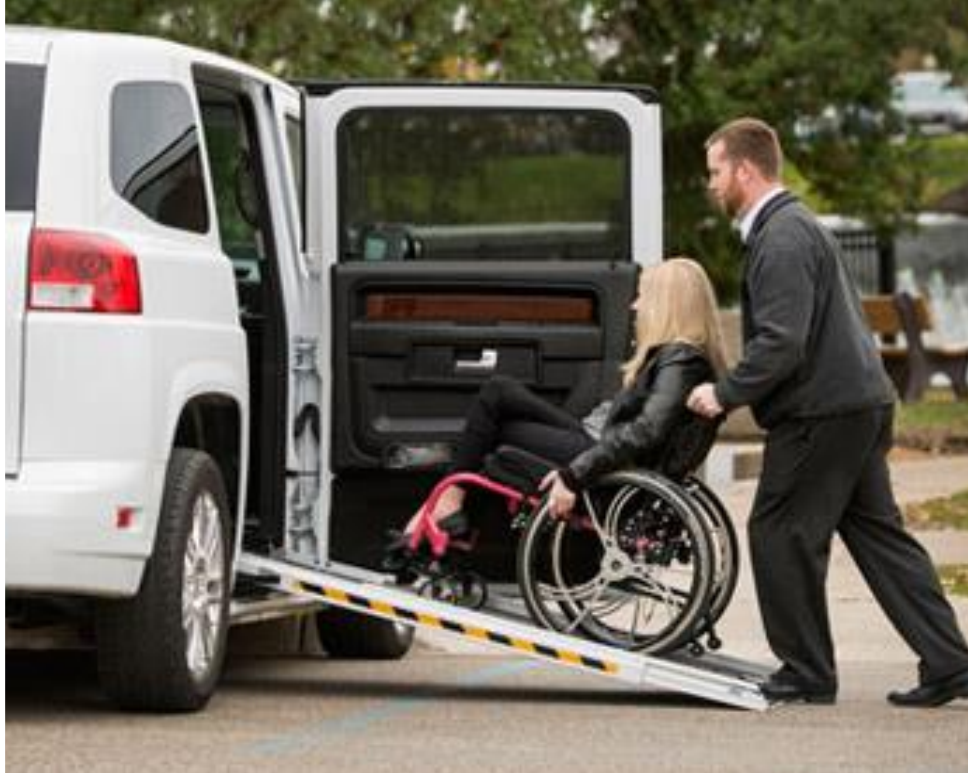
CTC Selection for Glades/Hendry