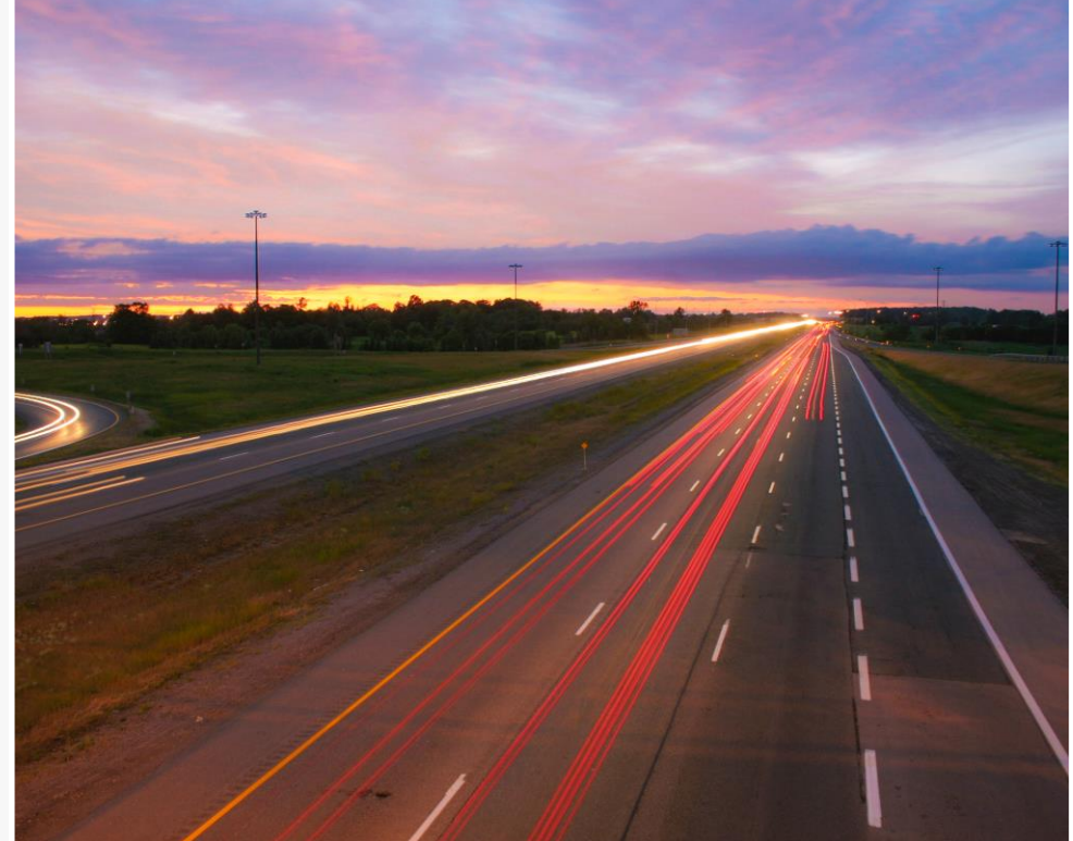
Transportation Improvement Program Outreach